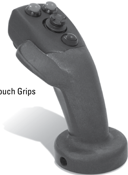
G3 Soft Touch Grips